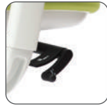
Seat Height & Tilt Tension