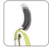
Height Adjustable Headrest