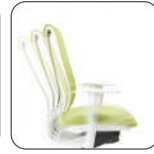
Synchronized & 4 Locking