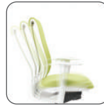
Synchronized & 4 Locking