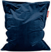
Original Slim Velvet